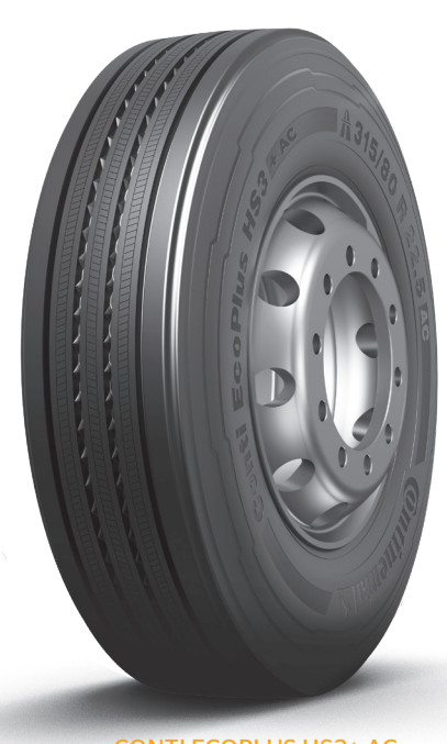
CONTI ECOPLUS HS3+ AC